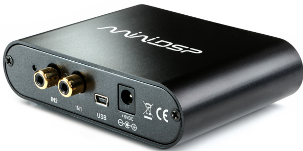
MiniDSP 2x4 RevB